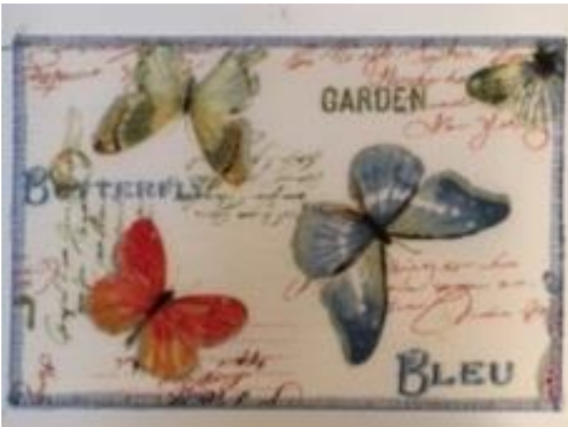
Lovely printed butterfly fabric postcard