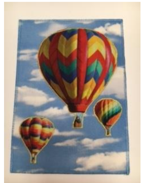
Hot air balloons using zig zag applique

Choosing and Treating Fabrics: Depending on the size of the card you are making, standard or large, make sure the novelty print is small enough to fit within the card size. For background fabric polka dots, small prints and solids work well. Treat all your fabrics with Terial Magic, dry to damp and press flat, then cut out the shapes.